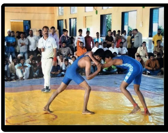
Glimpses of the participated Students.