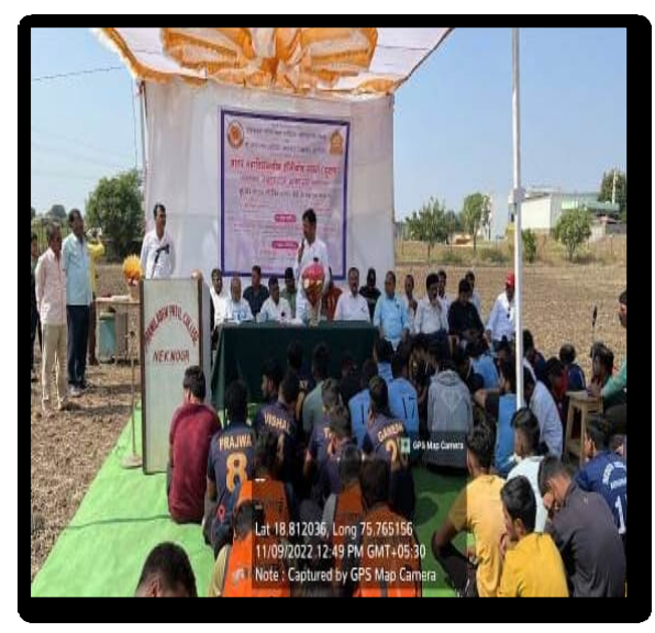
Chief guest addressing on the occasion of the Event.